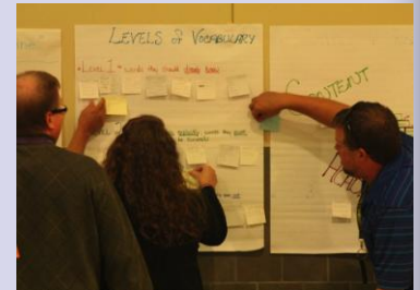
THS Staff begins to sort and develop vocabulary lists from Lead4Ward STAAR Vocabulary resource documents.