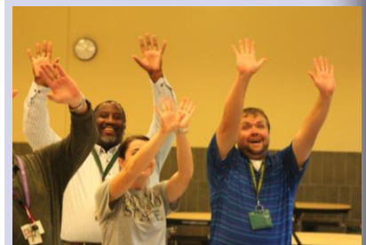
The Vocabulary and Oral Development PD “booster” session ends with a TPR game. Faculty demonstrates the motion to go with the vocabulary word “chromosphere”.